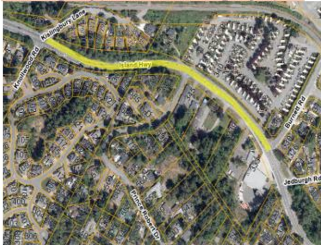
Island Highway (Burnett Rd to Kislingbury Ln)