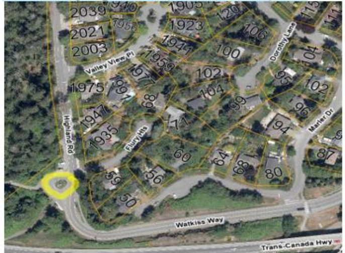
Watkiss Way/Highland Rd (Bus turn around)